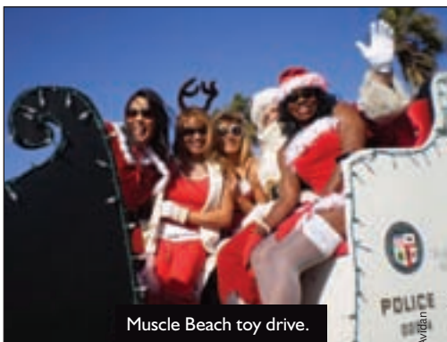
Muscle Beach toy drive.