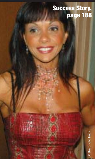
Success Story, page 188