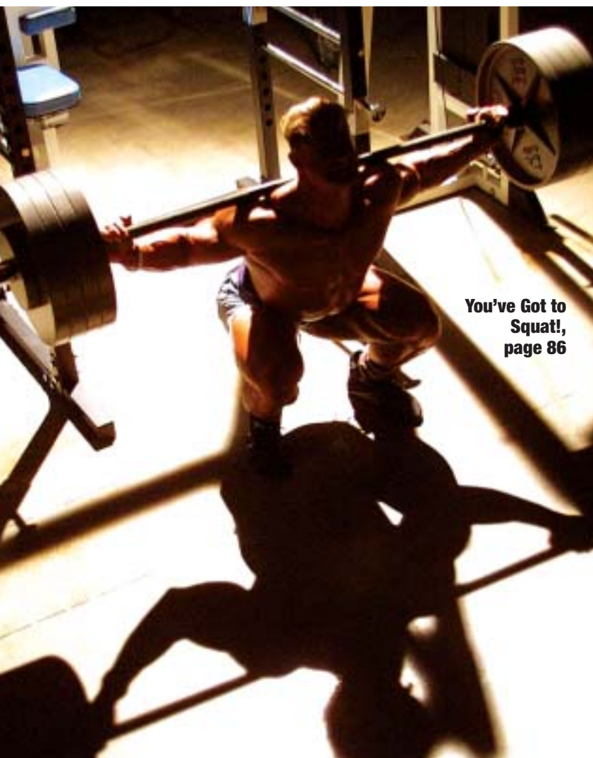
You've Got to Squat!, page 86