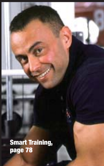
Smart Training, page 78