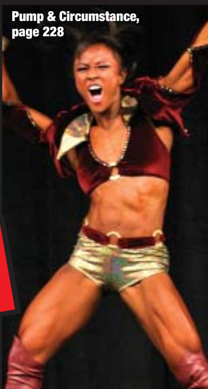
Pump & Circumstance, page 228