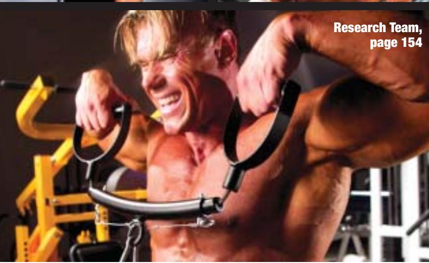
Research Team, page 154