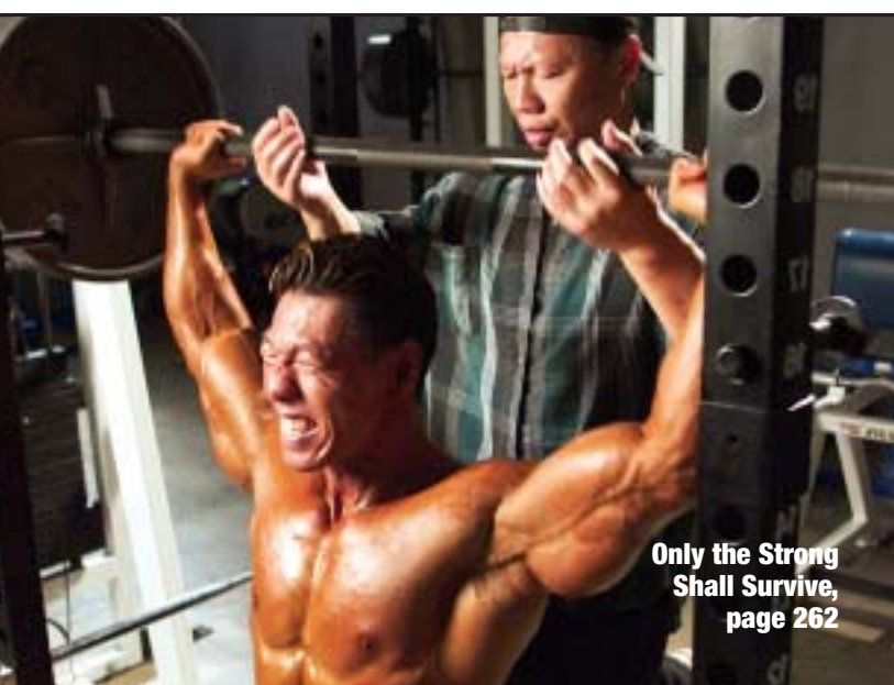
Only the Strong Shall Survive, page 262