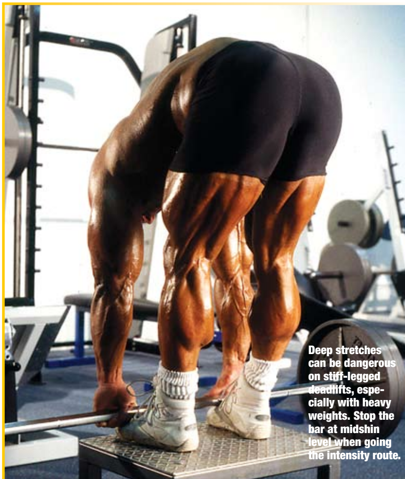
Deep stretches can be dangerous on stiff-legged deadlifts, especially with heavy weights. Stop the bar at midshin level when going the intensity route.