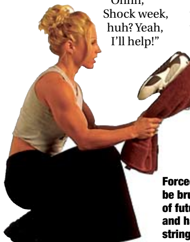
Forced negatives can be brutal. Beware of future soreness and hammered hamstrings.

"Ohhh, Shock week, huh? Yeah, I'll help!"